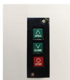
3 Button Station For external motor