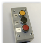
Nema-4 3 Button Station Waterproof plastic housing